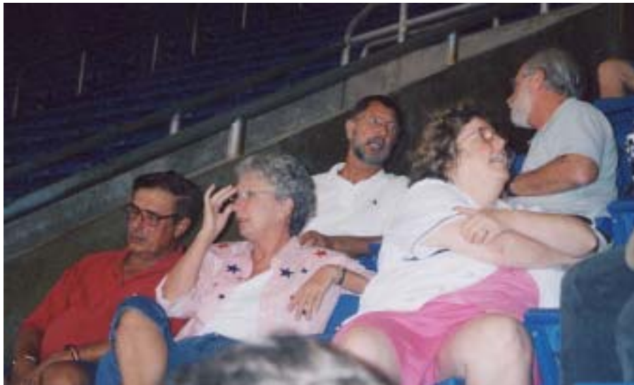
FOMA-ites at the August Meeting/Rays Game